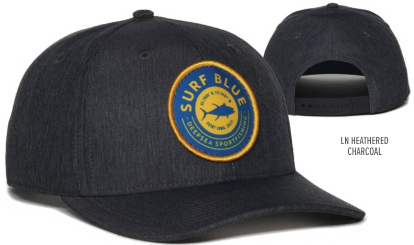
LN HEATHERED CHARCOAL