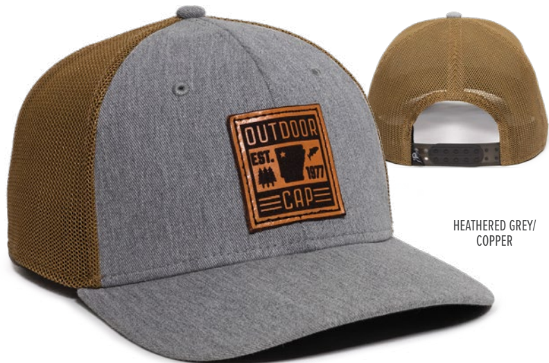
HEATHERED GREY/ COPPER