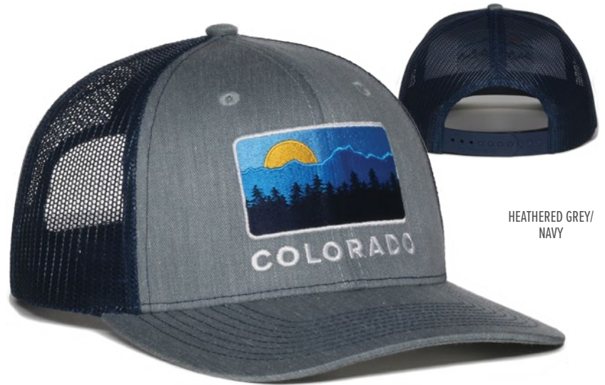
HEATHERED GREY/ NAVY