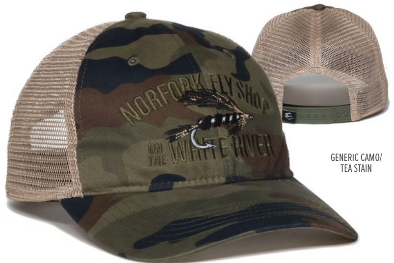
GENERIC CAMO/ TEA STAIN