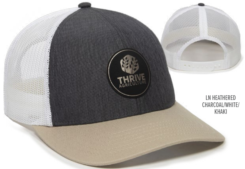
LN HEATHERED CHARCOAL/WHITE/ KHAKI