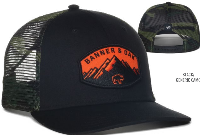
BLACK/ GENERIC CAMO