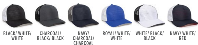
BLACK/ WHITE/ WHITE